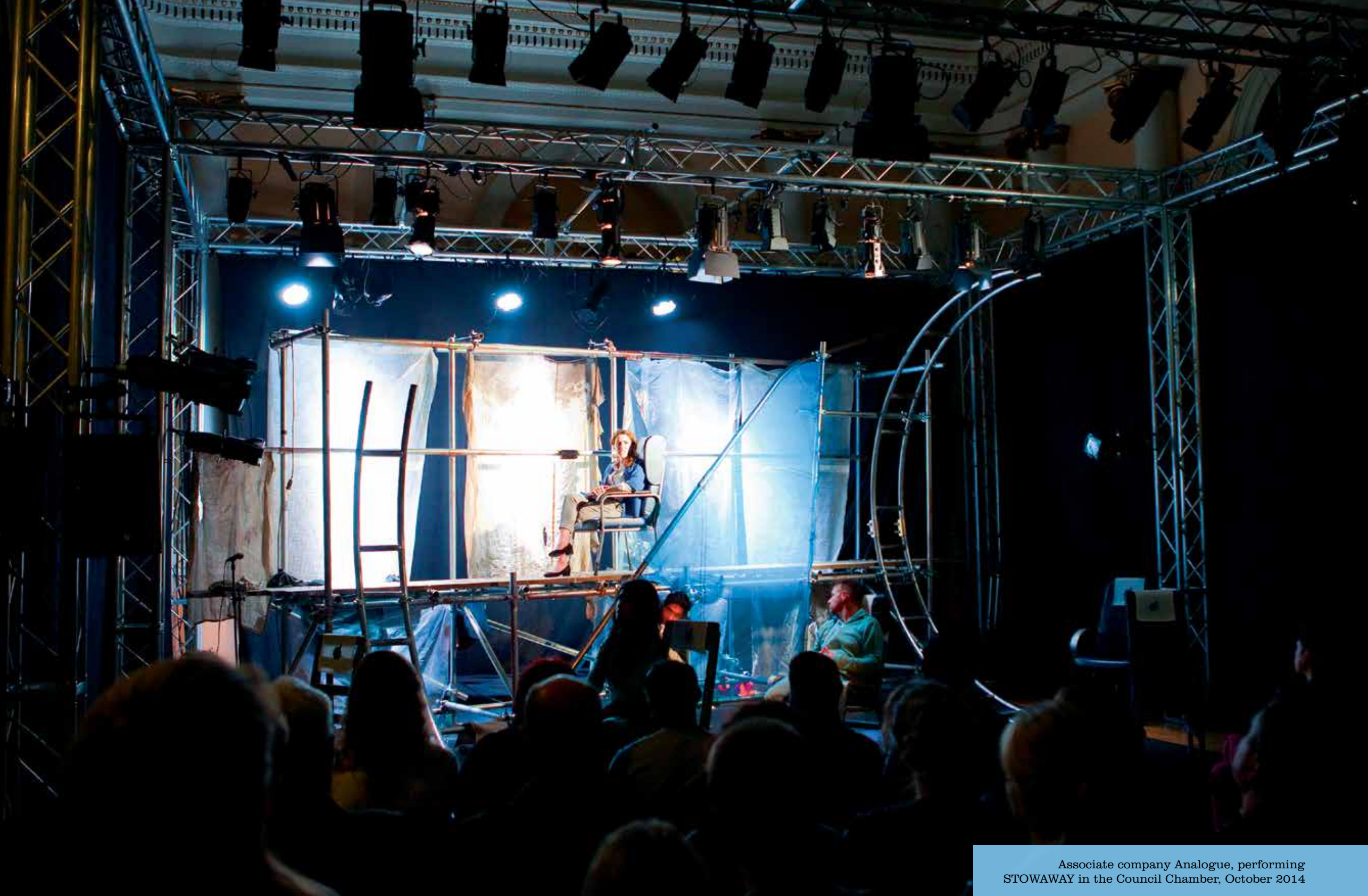
Associate company Analogue, performing STOWAWAY in the Council Chamber, October 2014